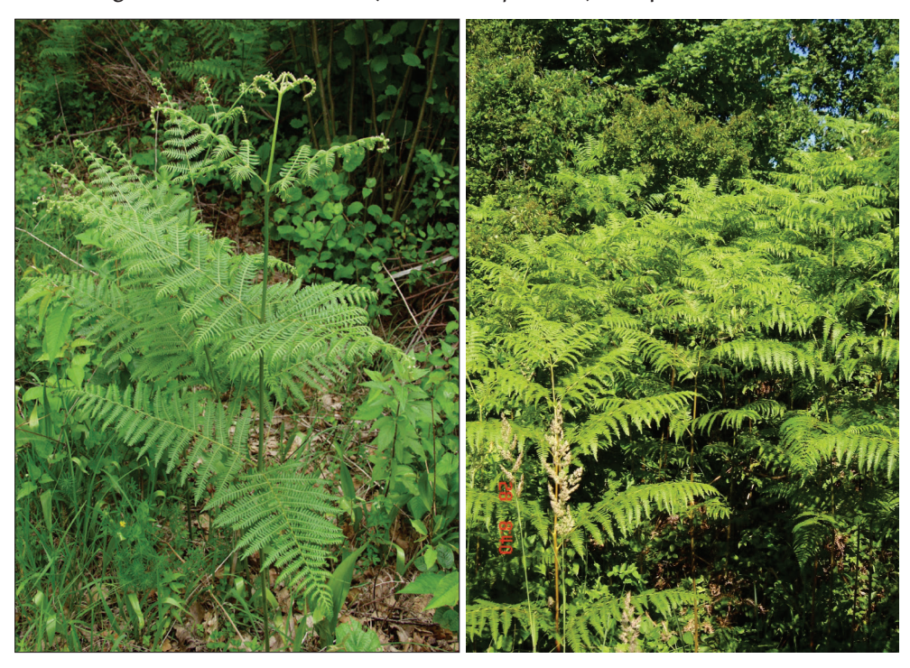
Figure 1 A&B. Bracken fern (Pteridium aquilinum) in Papuk Nature Park<sup>1</sup>